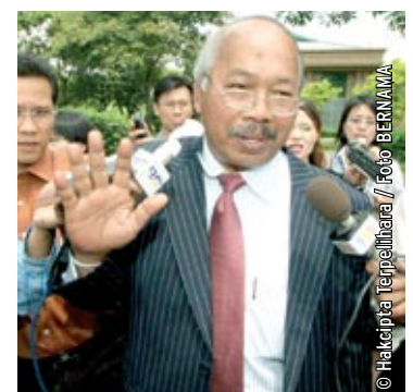
ABOVE (top to bottom):

Unloading Indonesian timber at Kuala Linggi port.