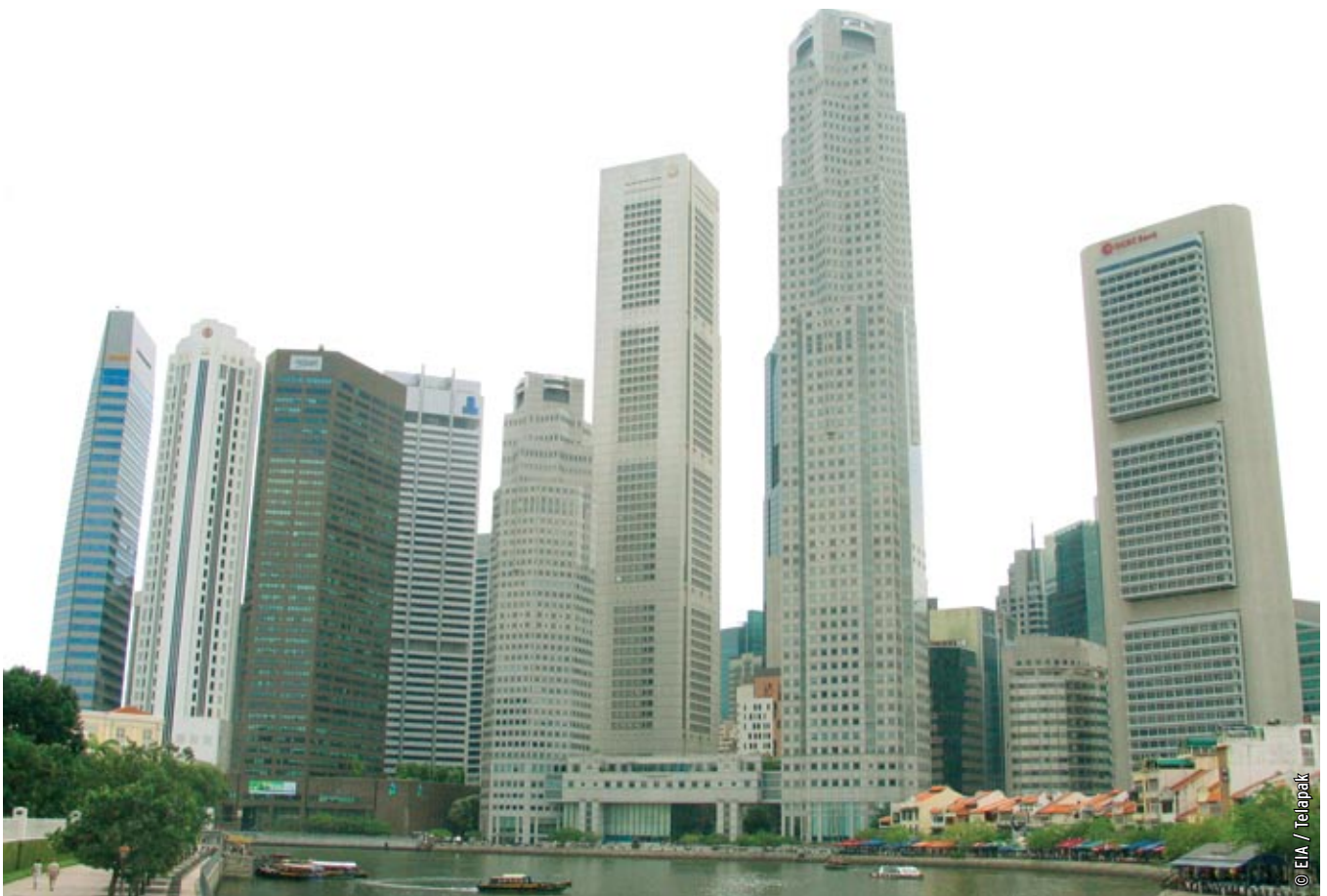
ABOVE: Singapore's financial district – confidentiality guaranteed.