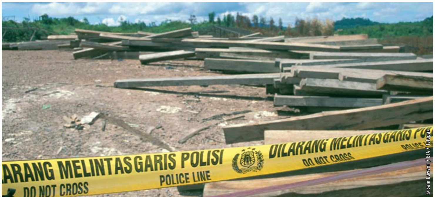
ABOVE: Enforcement usually fails to catch the real culprits.