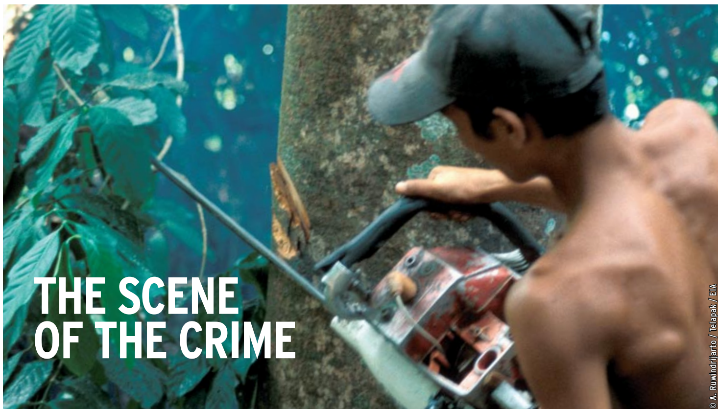
ABOVE: Gunung Leuser National Park – illegal logging is occurring in 37 out of 41 protected parks in Indonesia.

Since the late 1990s Indonesia's precious rainforests have suffered one of the biggest environmental crimes the world has ever witnessed. From Aceh to Papua, forests across the sprawling archipelago have been systematically pillaged by rampant illegal logging on an unprecedented scale.