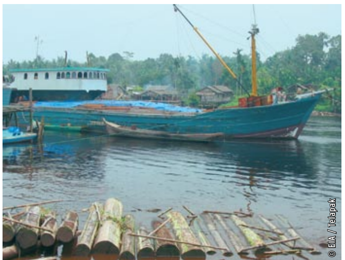
ABOVE (left to right): Coconuts used to conceal smuggled timber. Gaung River, Riau's main timber smuggling centre.

to US$4,000 in bribes each trip, especially in the areas of Tanjung Balai Karimun and Batam Island where the vessels sail close to the shore.