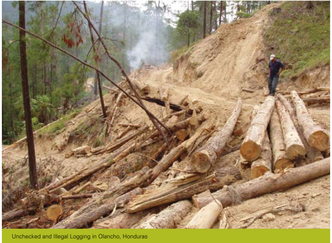
Unchecked and Illegal Logging in Olancho, Honduras